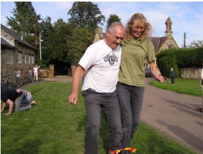
Three-legged race (not quite) winners romping home, but spare a thought for the team in a heap on the grass

The Village Fund is holding its first AGM on Thursday 2 November in the Old School. Please come along to hear the chair's and treasurer's reports, and contribute your comments on the Fund.