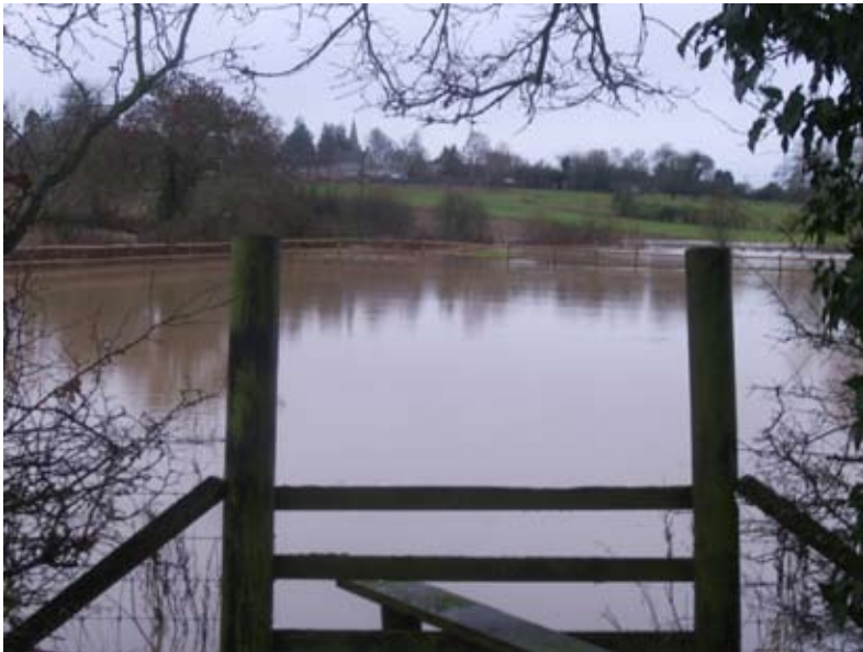
The Tove in flood

How fortunate we are that our village has been built on higher ground above the Tove flood plain. The flooding this year has been noteworthy, but sadly as the Environment Agency's measuring station on the Tove at